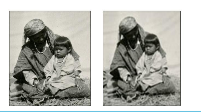
Image on the left is a higher resolution than the image on the right.

The density of pixels in an image Measured in pixels per inch Impacts amount of storage space Impacts versatility of image